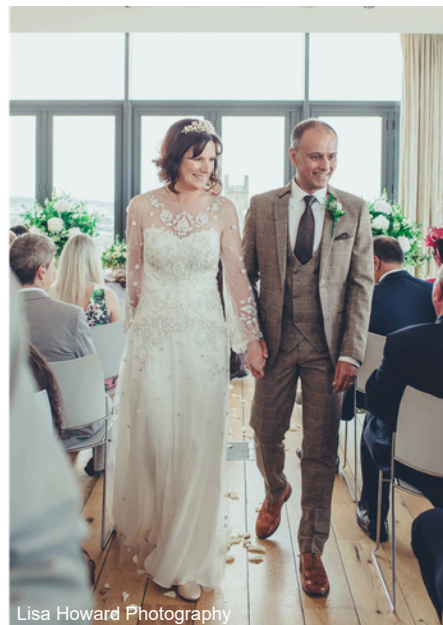
Lisa Howard Photography