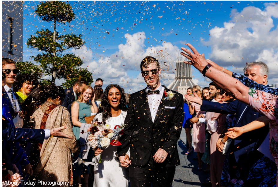
About Today Photography